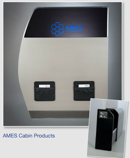
AMES Cabin Products