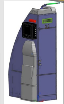
Full height stowage